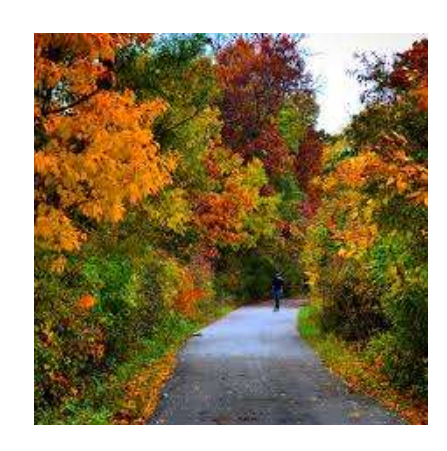
Staff are present for this event.