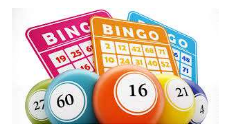
Staff are present for this event.