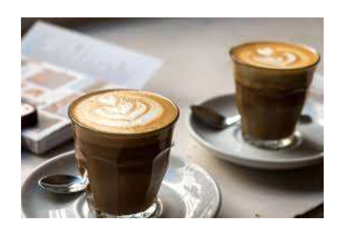
Staff are present for this event.